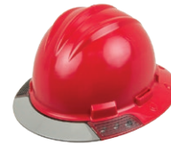
Grey Visor Shade