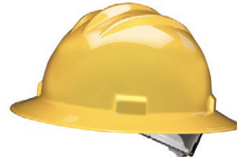
S71 - Standard Full Brim Hat