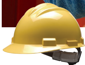
S61 - Standard Cap Style