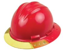
Yellow Visor Prevent Glare

Other colors available upon request. Minimum quantity requirements apply.