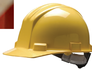
S51 - Cap Style w/Rain Trough