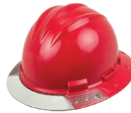
Clear Visor Full Visibility