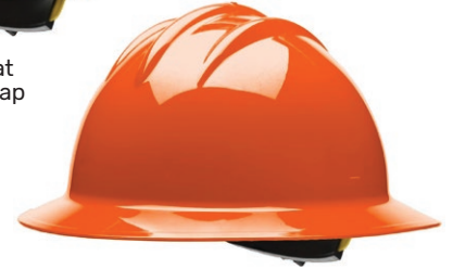
911H - High Heat Thermoplastic Full Brim