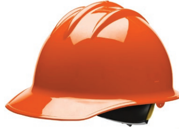
911C - High Heat Thermoplastic Cap

Vector helmets offer advanced head protection and comfort at an affordable price. The lightweight Vector helmets are compliant with ANSI/ISEA Z89.1-2014, Type II, Class E & G and CSA Z94.1-2015, Type 2, Class E & G. The Sportek brow pad, comfortable suspension, built-in goggle strap retaining slots, and Bullard's unsurpassed reputation for quality make Vector helmets a superior value in industrial head protection.