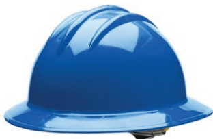
C34 - Classic Extra Large Full Brim Style