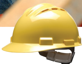
S62 - Vented Cap Style