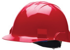
Type II Helmet - Red