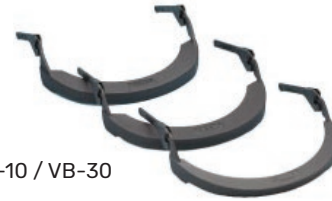
VB-10 / VB-30