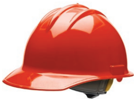
C30 - Classic Cap Style