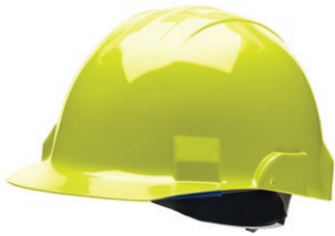
Type II Helmet - Hi-Viz Yellow

Vector helmets offer advanced head protection and comfort at an affordable price. The lightweight Vector helmets are compliant with ANSI/ISEA Z89.1-2014, Type II, Class E & G and CSA Z94.1-2015, Type 2, Class E & G. The Sportek brow pad, comfortable suspension, built-in goggle strap retaining slots, and Bullard's unsurpassed reputation for quality make Vector helmets a superior value in industrial head protection.