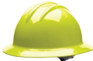
C33 - Classic Full Brim Style