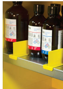
29985 - Set of 4

Rolling Cart makes it easy to move a heavy safety cabinet—transport solvents and chemicals directly to your work area. All welded 1/8-in (3-mm) thick heavy-duty steel and 5-in (127-mm) poly caster wheels with brakes for added safety. Push handle is removable. Fits any cabinet 43-in W x 18-in D (1092-mm x 457-mm) with a maximum height of 44-in (1118-mm).