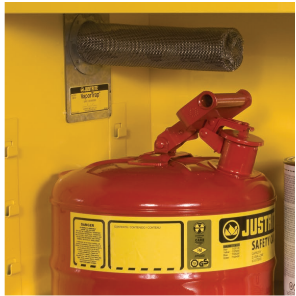
For increased safety, position one or two VaporTrap™ Filters inside the cabinet.

Note: Due to variables such as the chemical itself, its purity, or its vapor pressure, temperature, humidity, charcoal age, etc., it is difficult to estimate VOC vapor adsorption rates. The Justrite VaporTrap™ Carbon Filter is not intended to be used as a substitute for using safe closed containers as required by OSHA and the EPA. It is important to clean up spills and residues from the cabinet and containers.