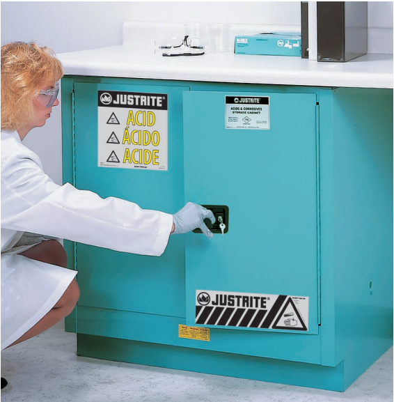
Self-latching doors include paddle handle with cylinder lock.