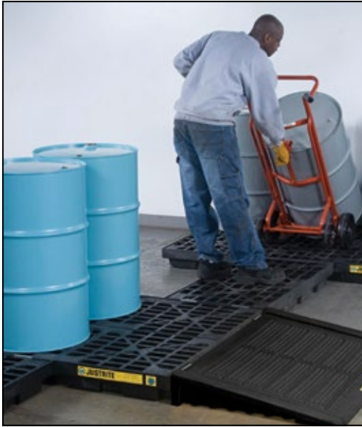
Modular design lets you join centers together to fit your space and application.