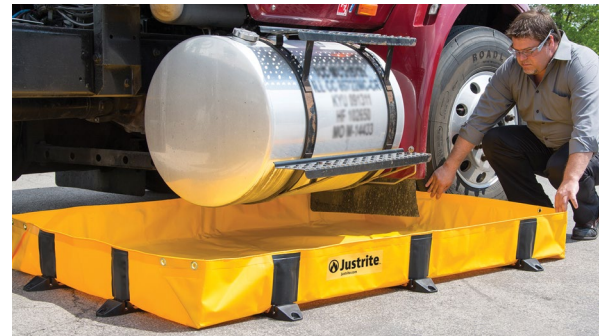
Rigid-Lock QuickBerm Lite

A simple tug locks supports in upright position.