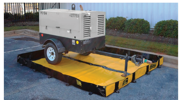
Rigid-Lock QuickBerm All-in-One

▲* WARNING: This product can expose you to chemicals including diisononyl phthalate and lead, which are known to the State of California to cause cancer and birth defects or other reproductive harm. For more information go to www.P65Warnings.ca.gov .