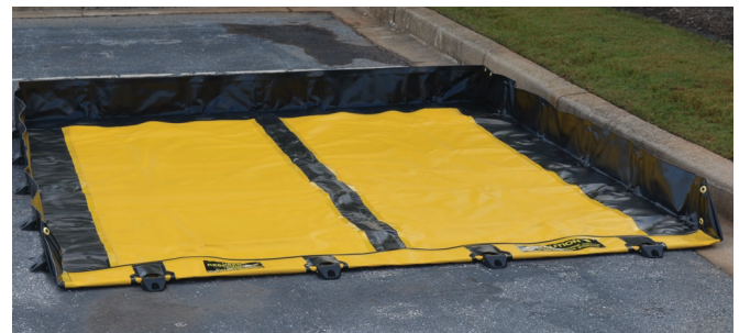
Rigid-Lock QuickBerm All-in-One