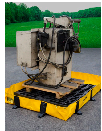
Rigid-Lock QuickBerm Lite