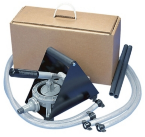
Ex. Manual Pump Kit (DRM635)

See supplement "New Pig Pump Selection Guide" to learn which pump is suitable or click here: <u>PIG Pump Selection Guide</u>