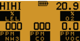
Display in alarm conditions