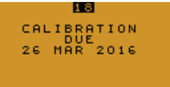
Configurable calibration options