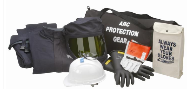
Optional: FP-AG32 comes with gloves with lether protectors and gear bag

Flash-Pro™ Electric ARC Flash protection kit is designed by Elvex to protect workers from thermal energy releases up to 32 cal/cm², for NFPA70E hazard risk category 3 applications.