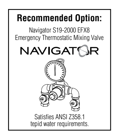
Page 1 of 2 2/10/2012 This information is subject to change without notice. Bradley_SafetyDrenchHose_S19-460_465

8' (2438mm) yellow reinforced thermoplastic hose has % " NPT male thread. Burst strength is 450 PSI.