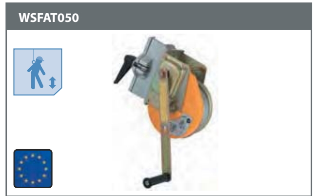
WORKSafe® AT050 Rescue Lifting Device