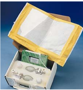
Oualitative Test Kit