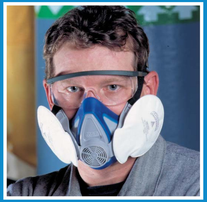
The 200 LS integrates well with other PPE

Donning the mask is made easier with MSA's new preadjustable straps. With the Advantage 3200 Respirator, you can position the upper straps for a consistent fit and minimal adjustment, time after time. The pre-set upper straps prevent uncomfortable snags during donning and doffing, and also provide a tighter, more secure seal. Wearers also have the option of the new European-style Advantage harness, which dons like a catcher's mask.