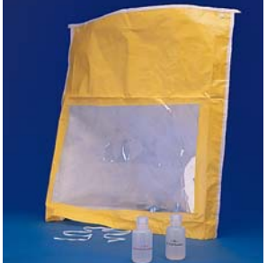
Replacement Hood and Test Solutions