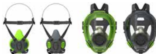
Half masks BLS 4000 S - BLS 4000R