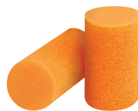
FirmFit® Developed for long wear-time comfort NRR30 Canada Class A (L)