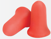
MAX® Superior noise-blocking performance NRR33 Canada Class A (L)

Offer a variety of earplugs on the job – not just one type of earplug for the entire team. The Max disposable earplugs are the world's most-used polyurethane foam earplugs and are designed for maximum protection in high-noise environments. The Max Lite, Laser Lite and Max Small disposable earplugs are intended for smaller ear canals. Howard Leight's no-roll FirmFit earplugs offer an option for easier insertion. The tapered design of the X-TREME earplug offers the comfort while providing protection. Choose the protection that best fits your workers.