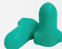
MAX Lite® Comfort for smaller ear canals NRR30 Canada Class A (L)