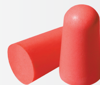
X-TREME™ Tapered design for comfort and protection NRR32 Canada Class A (L)