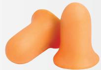
MAX® Small MAXimum protection, minimum exposure NRR30 Canada Class A (L)