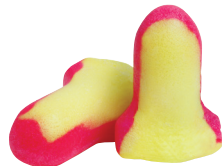
Laser Lite® High-visibility hearing protection NRR32 Canada Class A (L)