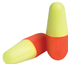
Multi Max® One size fits many NRR31 Canada Class A (L)