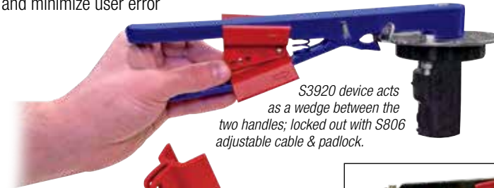
S3920 device acts as a wedge between the two handles; locked out with S806 adjustable cable & padlock.

The exclusive, patented Master Lock gate and ball valve lockout devices work in difficult applications like tight spaces and insulated pipes.