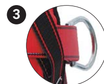
EN 358 Work positioning belt with side attachment buckles