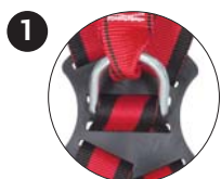
EN 361 Dorsal attachment D-ring