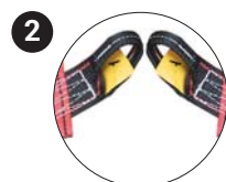
EN 361 Front attachment point