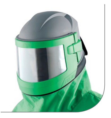
RPB° NOVA 3°

The RPB® T100™ Series is your solution. It provides lightweight protection, superior safety and premium quality, making it economical through increasing productivity at a low cost. Manufactured from DuPont® Tychem®, it is lightweight, offering superior comfort compared with the conventional, tight, full-face respirator.