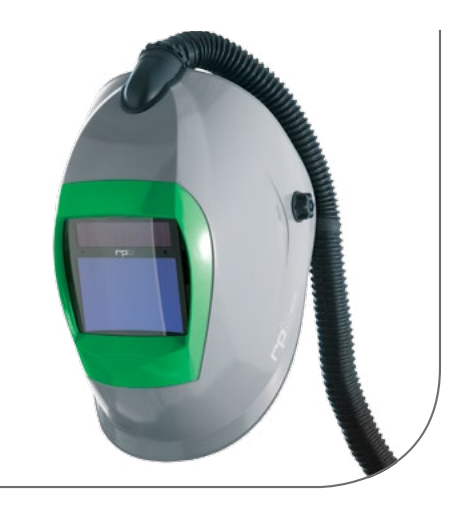
RPB° Z3™ WELDER

The RPB° Nova 3™ is an advance on the RPB° Nova 2000™ in comfort and functionality. It can also be customized to suit individual needs, further enhancing employees' performance. It meets worldwide safety standards worldwide including NIOSH, ANSI Z87.1 -2010+, ANSIZ89.1 -2012 Type 1.