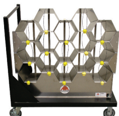
AK40-15CRT Cart Mounted

AIR-KADDY™ 8, 11, and 15 cylinder storage racks can be cart mounted. Contact Customer Service for details.