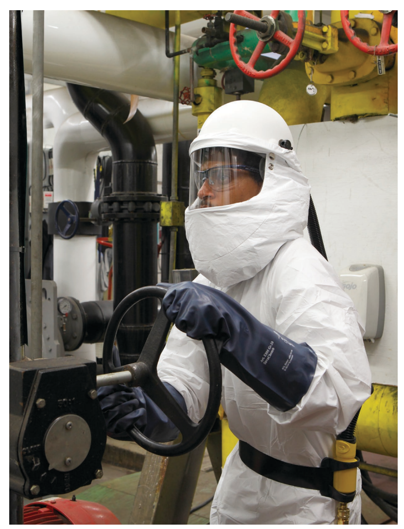
WARNING! Honeywell Respiratory equipment should only be used in conjunction with the manufacturer's Operating and Maintenance User Instructions. Failure to follow such instructions could result in serious injury, illness or fatality.