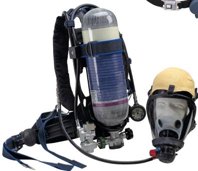
1997 Style Panther