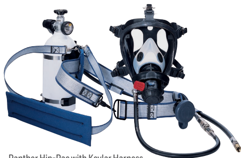
Panther Hip-Pac with Kevlar Harness