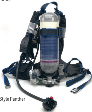
2002 Style Panther

To build your own SCBA to meet your unique worksite needs, visit the Honeywell SCBA Configurator at scbaconfig.honeywellsafety.com . For more information, visit honeywellsafety.com/TITANSCBA .