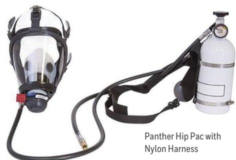
Panther Hip Pac with Nylon Harness

Panther Hip-Pac Series, Mask-Mounted Regulator, Emergency Escape (No Coupling); System includes Medium Twenty/20+ Full Facepiece