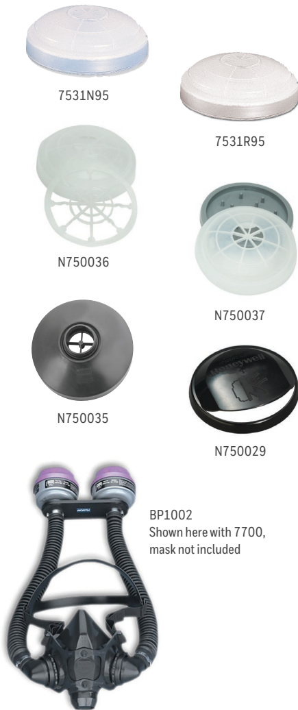
BP1002 Shown here with 7700, mask not included