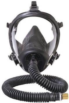
CF4001; facepiece not included