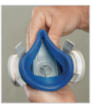
Facepiece-to face Anthrocurve

The Advantage 200 LS is a comfortable, efficient and economic half mask. It is ideal for applications where workers are exposed to various hazards from job to job, such as high concentrations of fumes, mists and gases.