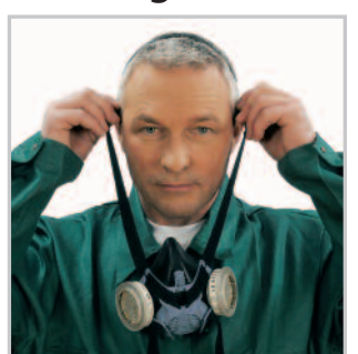
Place cradle on head