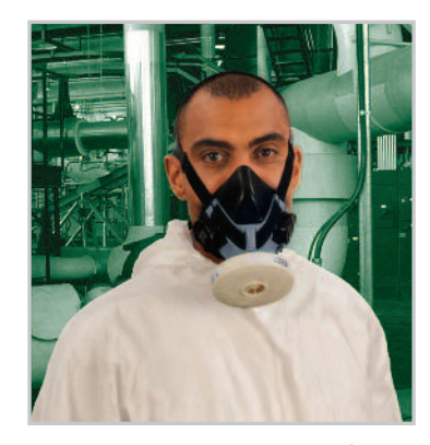
Advantage 410 with P3 PlexTec filter

For detailed information on standard thread filters please see leaflet 05-100.2.