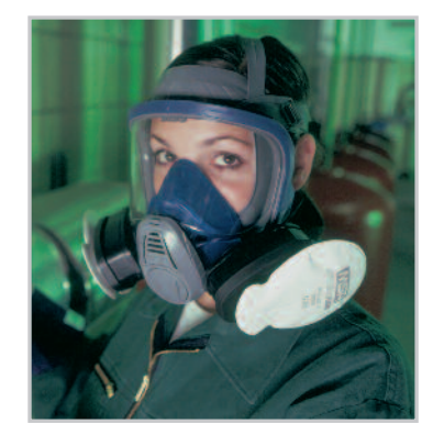
Advantage 3200 with TabTec and FLEXIfilter

The three filter lines are for use with Advantage 3200, Advantage 200 LS and Advantage 420.