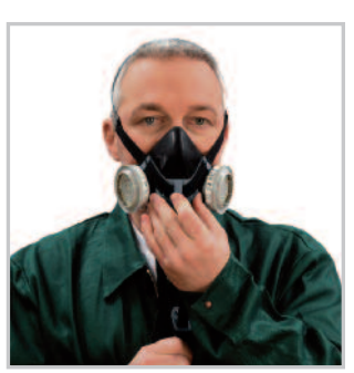
Pull down front straps and lock lever