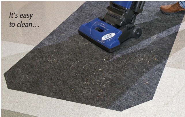
It's easy to clean...