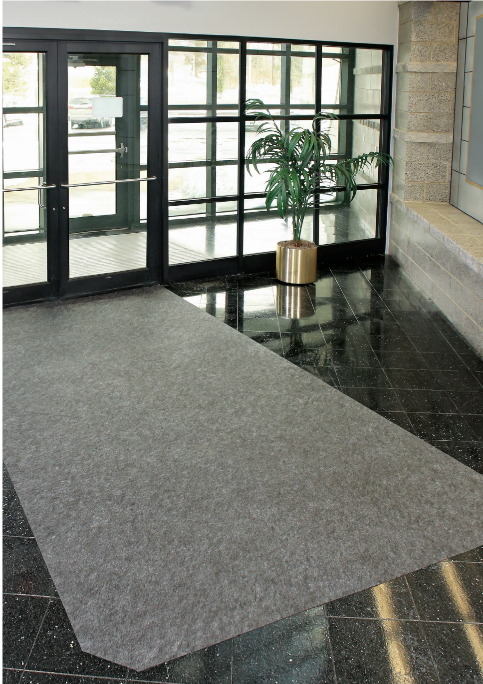
The world's first adhesive-backed mat: PIG Grippy Floor Mat

New Pig engineers took on the problem of floor safety and created a whole new breed of floor mat: the adhesive-backed mat . This high-tech mat is made with both a durable, absorbent top that efficiently captures dirt, grime and moisture, and a proprietary adhesive layer that keeps it securely in place.