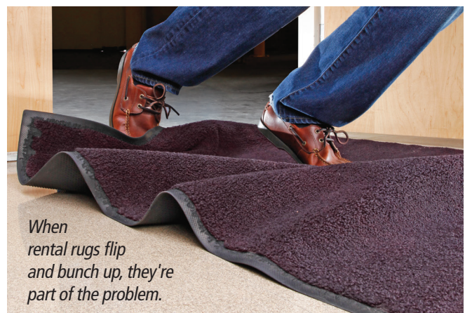
When rental rugs flip and bunch up, they're part of the problem.

Risk management and commercial insurance provider Zurich North America reports that the average cost of a workers' comp claim is $18,202, and a general liability claim is $7,770. But for every $1 of direct costs, Zurich estimates that there are at least $3 of indirect — and uninsured — costs that can include overtime paid to make up for lost production, hiring and training a replacement worker, time spent investigating and reporting the accident, loss of reputation and revenue, and Occupational Safety and Health Administration (OSHA) fines. Out-of-pocket expenses can add another $54,600 to a workers' comp claim and raise general liability costs to nearly $31,000 per incident.