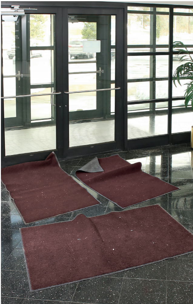
Fragmented mat coverage becomes an obstacle course of tripping hazards.

Myth #1: Rental mats increase floor safety. To be effective at removing dirt, grime and moisture, an entrance mat should fit the width of the entrance and provide about 8–10 feet of walk-off — enough for people to take at least six steps. So if an entrance requires 60 square feet of coverage, the ideal is a single 6' x 10' floor mat that protects the entire area.