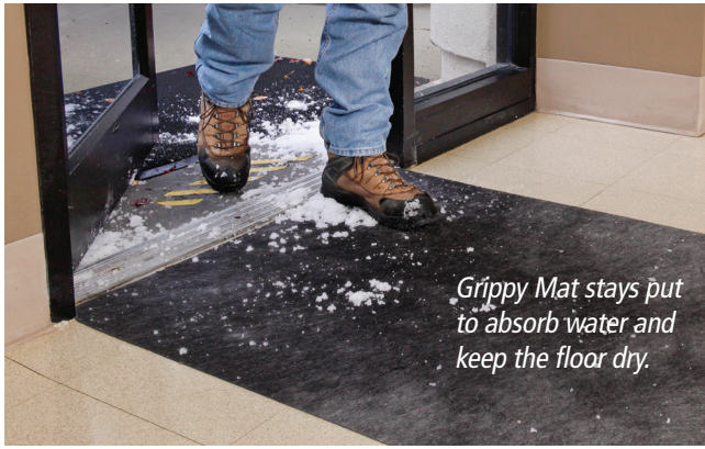
Grippy Mat stays put to absorb water and keep the floor dry.