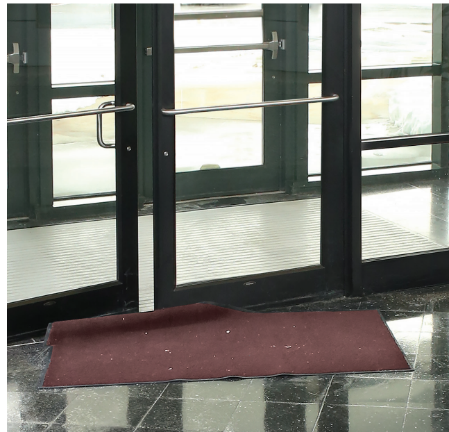
Bacon mats detract from a facility's appearance.

The biggest problem — and the one that prompts the most customer complaints — is a direct result of the laundering process. Heat from the dryer causes the mats to ripple, producing what is commonly referred to as "bacon mat." The rippling worsens when the mats are rolled or folded, and stacked for storage and delivery.