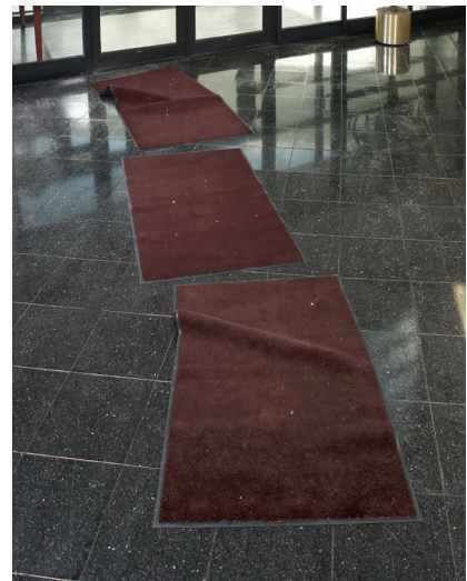
Carpeted floor mats shift because they depend on weight to stay put.

Replacing a saturated mat is no easy task, either. A 3' x 5' carpeted floor mat weighs about 32 pounds soaking wet, and a 3' x 10' runner twice that amount, making the job of dragging them out and hanging them to dry a back injury waiting to happen.