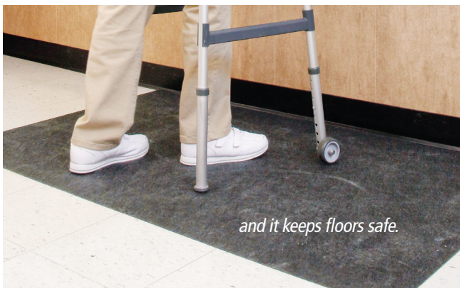
and it keeps floors safe.

out and keep water and dirt from being tracked onto the floor.