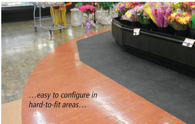
...easy to configure in hard-to-fit areas...