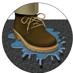
Water puddles on the surface of carpeted floor mats.