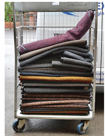
Stacked mats buckle.

The bottom line: Laundering aggravates the structural flaws in rubber-backed, carpeted floor mats. Heat and compression buckle the rubber backing, causing permanent ripples that create even more tripping hazards. And while many facilities choose rentals because outsourcing seems to be more efficient than owning and maintaining their own mats, renting is actually an expensive, potentially dangerous option that can increase slips, trips and falls.