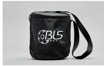
C41 - Washable bag with shoulder belt.