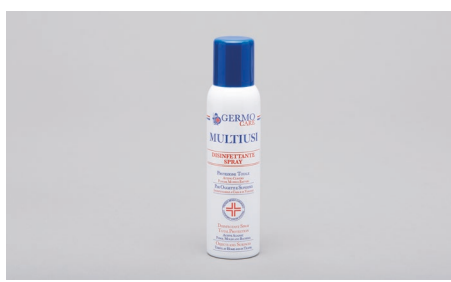
Q409 – 150ml disinfectant spray bottle.