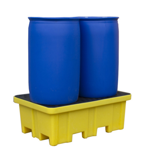
BP2R - Recycled