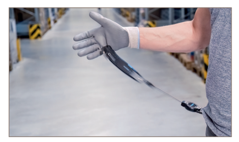
Knife at the moment of release.