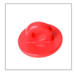
Anchor Hook External equipment attachment point

Customer Identification names & codes can be added to the base of the visor or on the back of the suit.