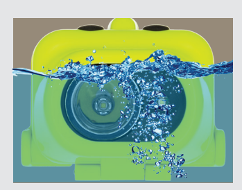
IP-X7 waterproof, impact & chemical resistant