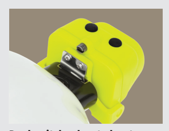
Dual switches located on top of light